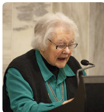
Dame Kate Harcourt