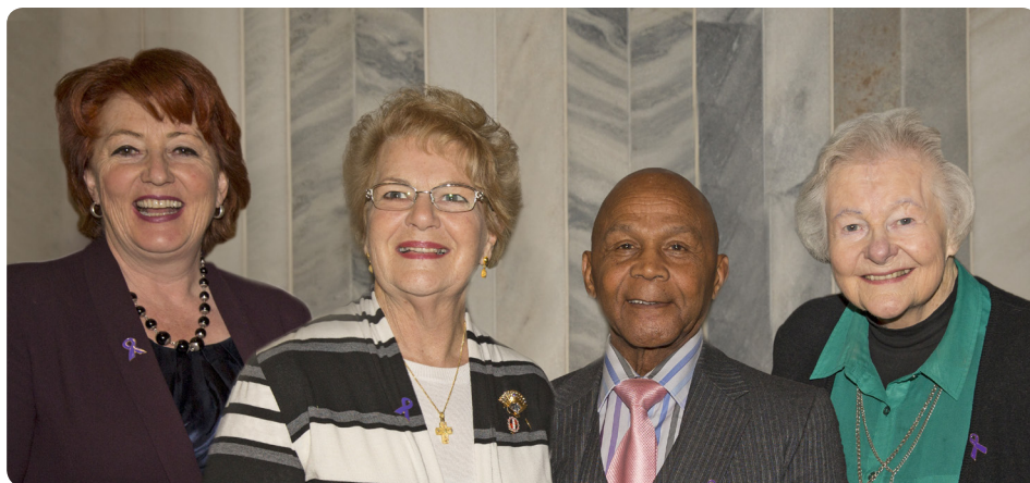
Minister for Seniors, the Hon Maggie Barry, with SuperSeniors champions Dame Malvina Major, Precious McKenzie and Dame Kate Harcourt.

Seniors Minister Maggie Barry is calling for a light to be shone on elder abuse over concerns the 2,000 documented cases each year represent only a small part of thousands more that go unreported.