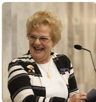
Dame Malvina Major