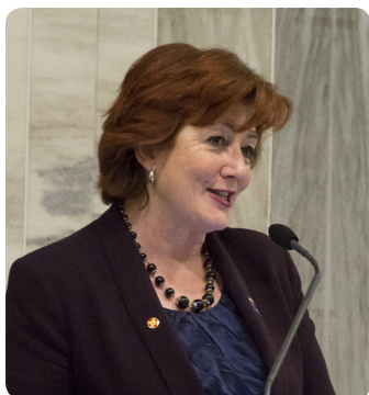
The Minister for Seniors

Advocates and representatives of older New Zealanders gathered at the Beehive on 15 June for a function hosted by the Minister for Seniors, the Hon Maggie Barry, to mark World Elder Abuse Awareness Day.