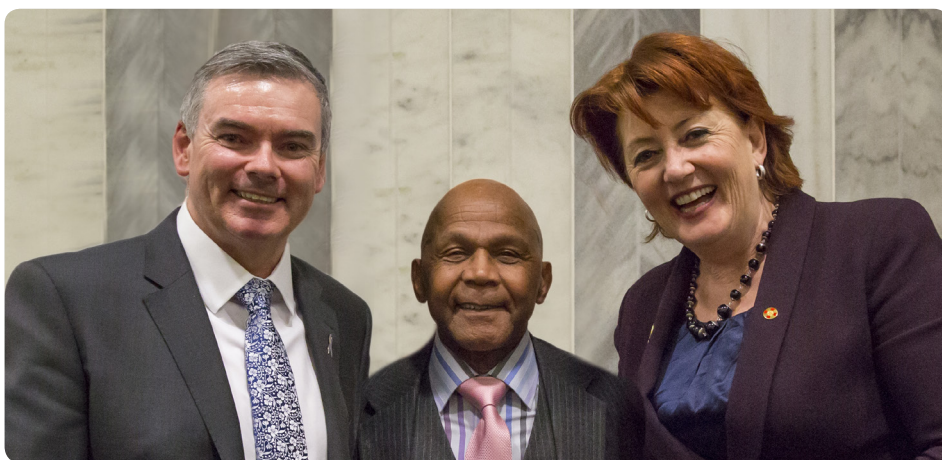
Coromandel MP Scott Simpson, with Precious McKenzie and the Hon Maggie Barry.